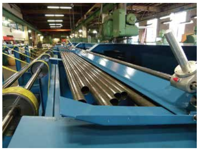
Tubes being loaded for high-speed cutting process.